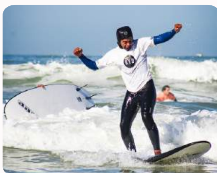
Team Little Optimist