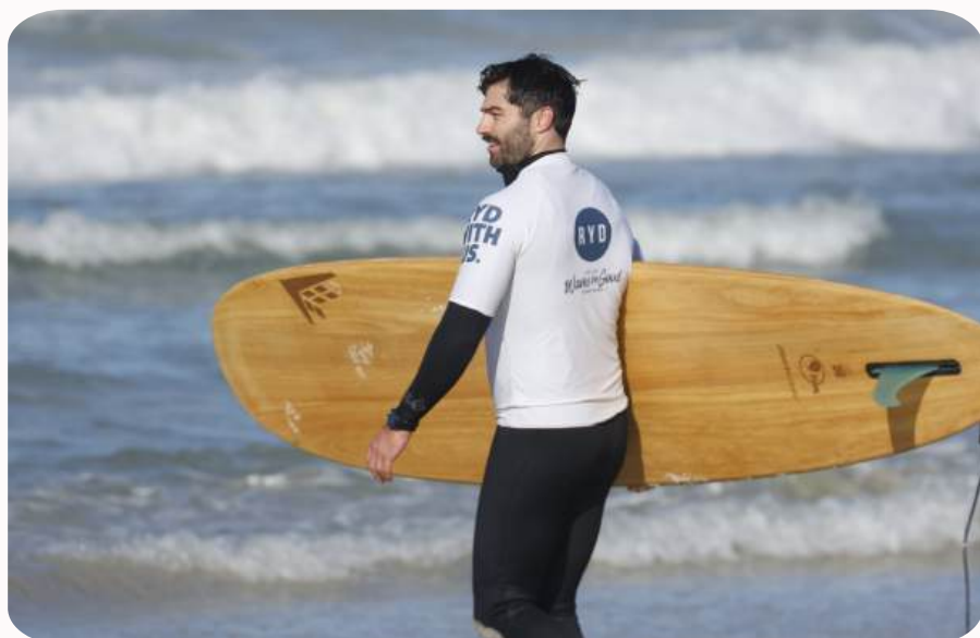
Team Flux Full Circle