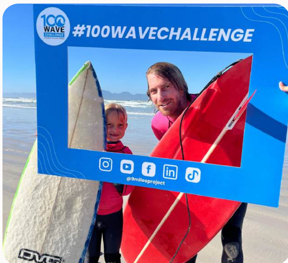
Team "Nel Family Wave"