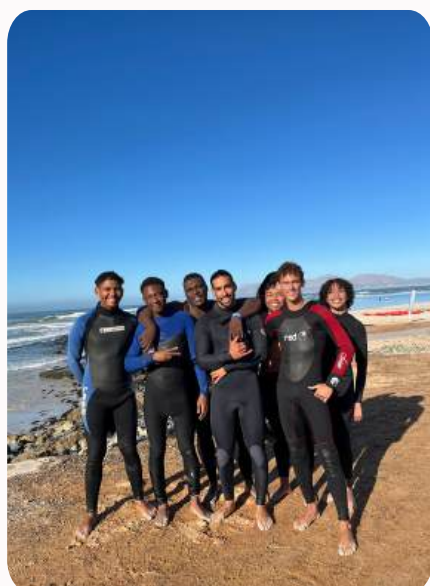
"The Locals" – 1 st group to finish!